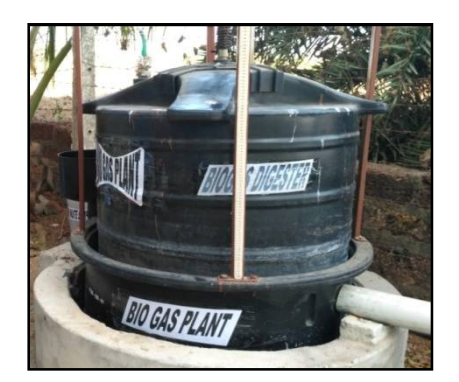
Fig 2 Biogas Digester

Biogas is produced from the food wastes, kitchen wastes, animal excreta and some other organic wastes. These organic wastes are collected from hostels, hotels & also from home. Then the organic wastes are allowed to digest by the bacteria in the process known as anaerobic reaction. The food wastes are collected from the canteen and the slurry being prepared by water with right proportion. Then the slurry is fed to the digester and facilitates the process of generation of gas in the absence of oxygen.