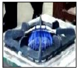
Fig 4 BioGas Burner

Biogas contains high volume of methane (CH<sub>4</sub>) and some impurities like carbon dioxide (CO<sub>2</sub>), hydrogen sulphide (H<sub>2</sub>S) etc. The presence of hydrogen sulphide (H<sub>2</sub>S) and carbon dioxide (CO<sub>2</sub>) becomes harmful due to their toxic nature. Due to its corrosive nature, hydrogen sulphide (H<sub>2</sub>S) highly affects metallic parts of the container and also produces sulphur dioxide (SO<sub>2</sub>). So the removal of hydrogen sulphide from biogas is essential for safe storage and supply in pipeline. The removal of carbon dioxide and hydrogen sulphide from the biogas is done by the scrubbing technology. Water scrubbing technology is a type of chemical scrubbing technology. It involves the use of pressurized water as an absorbent.